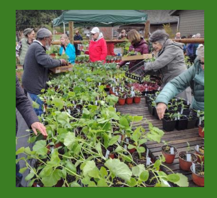
Plant Sales – May 4 & 25