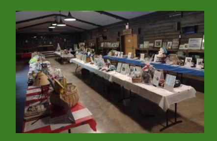
Silent Auction – July 6