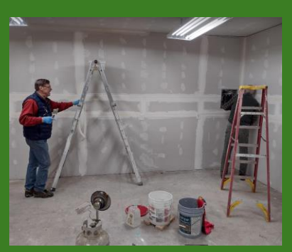
Weekly work party