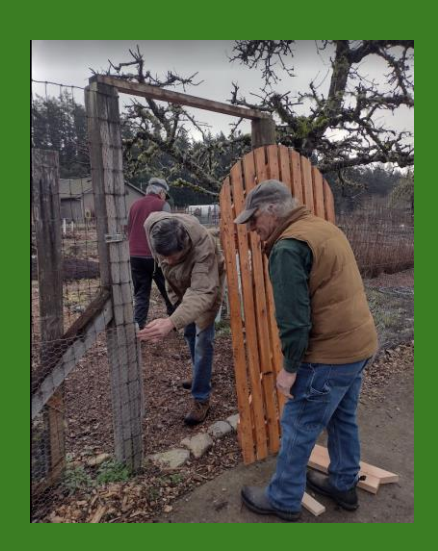
New Garden Gates