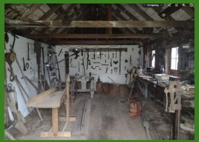
The Tool Shed