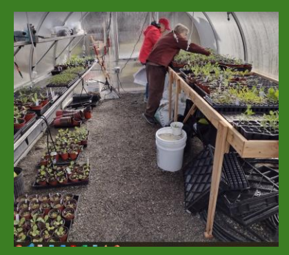
Greenhouse work party