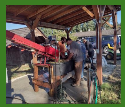
2023 Apple Squeeze