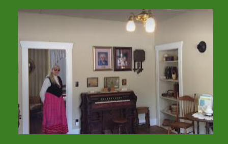
Docents in the Farmhouse